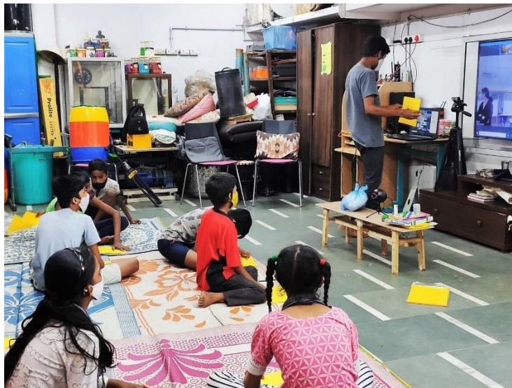
Online session with American School of Bombay