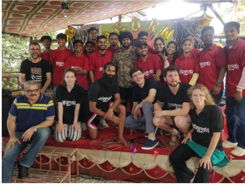
Dharavi rocks along side LalaLab