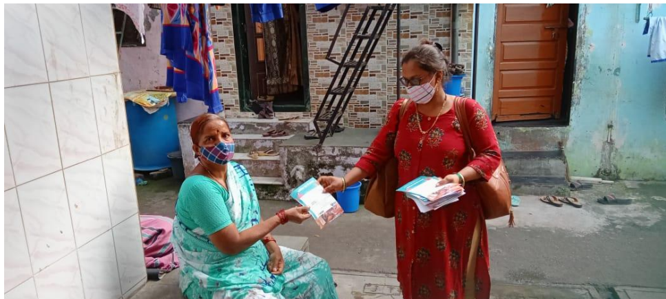
Acorn staff distributing flyers