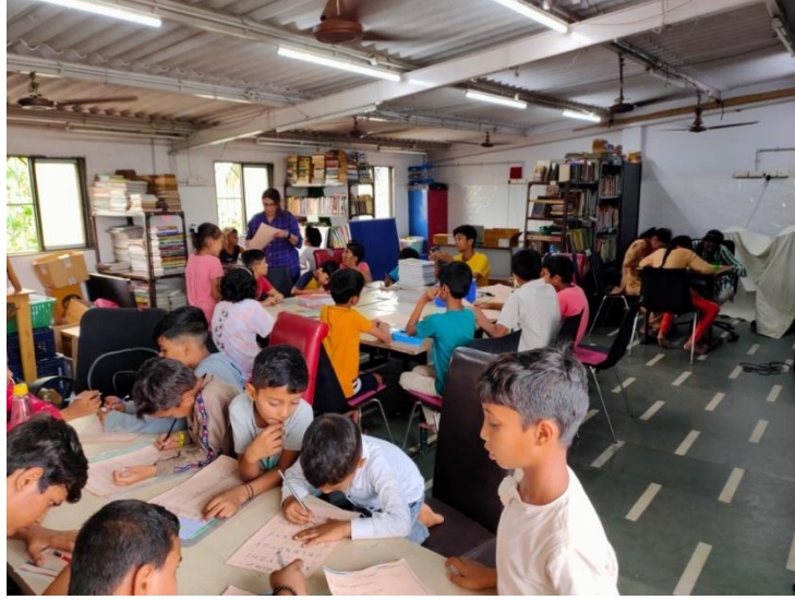
English class at Acorn Centre