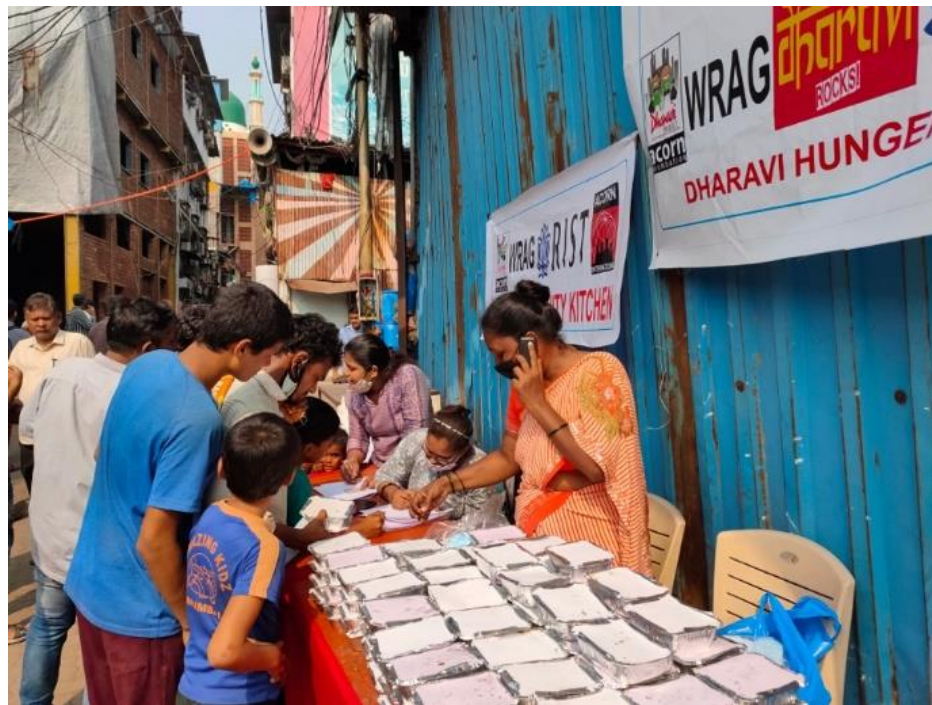
Acorn Community Kitchen at Sanaullah Compound, Dharavi