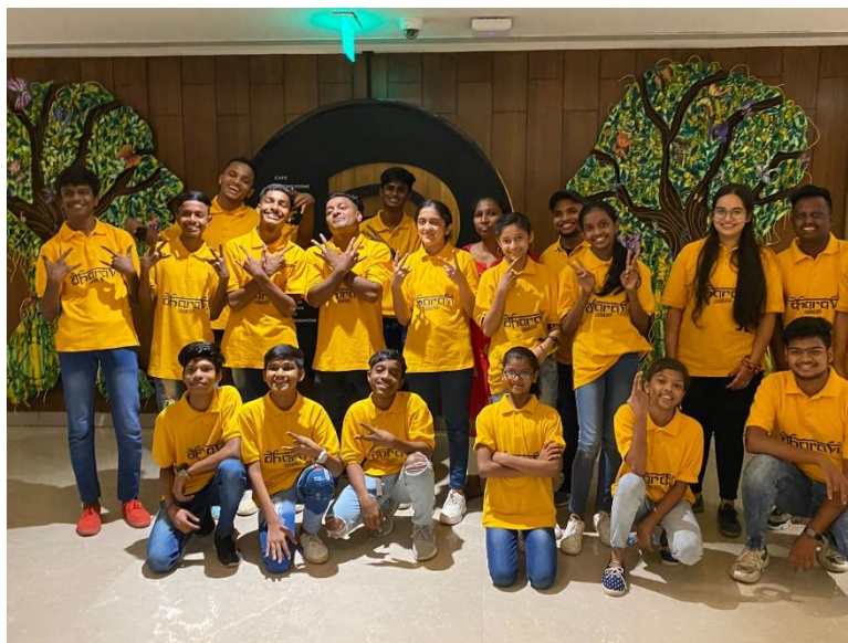
Dharavi Rocks performance at JW Marriott