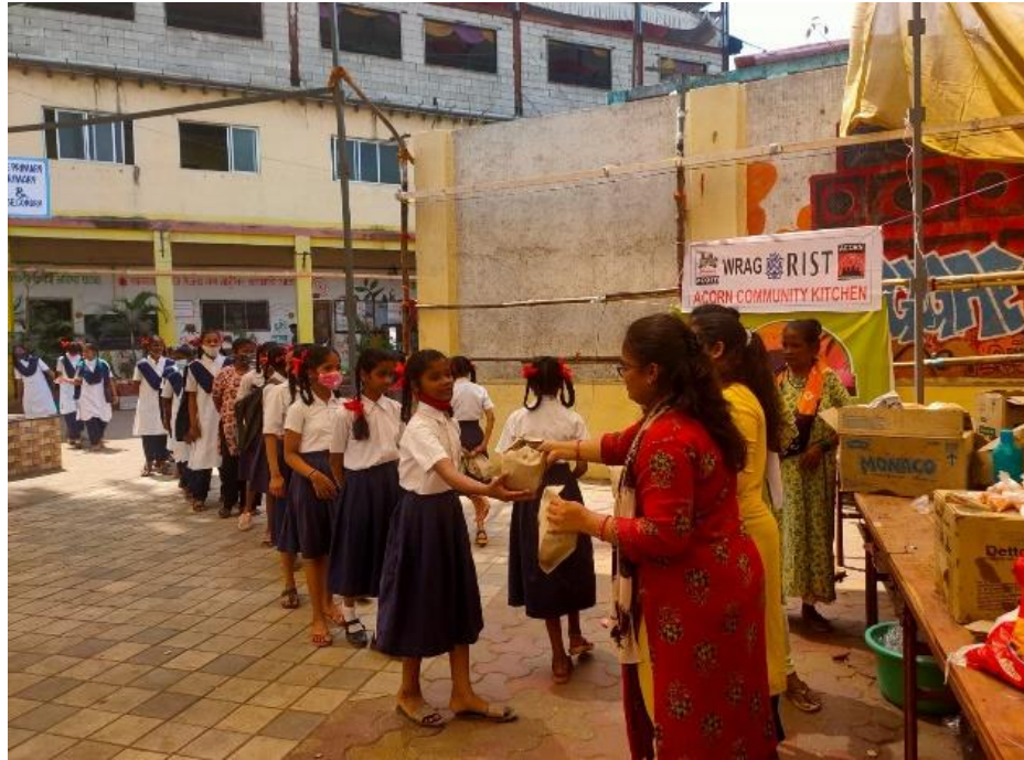
Food distribution Vidya Mandir School, Dharavi