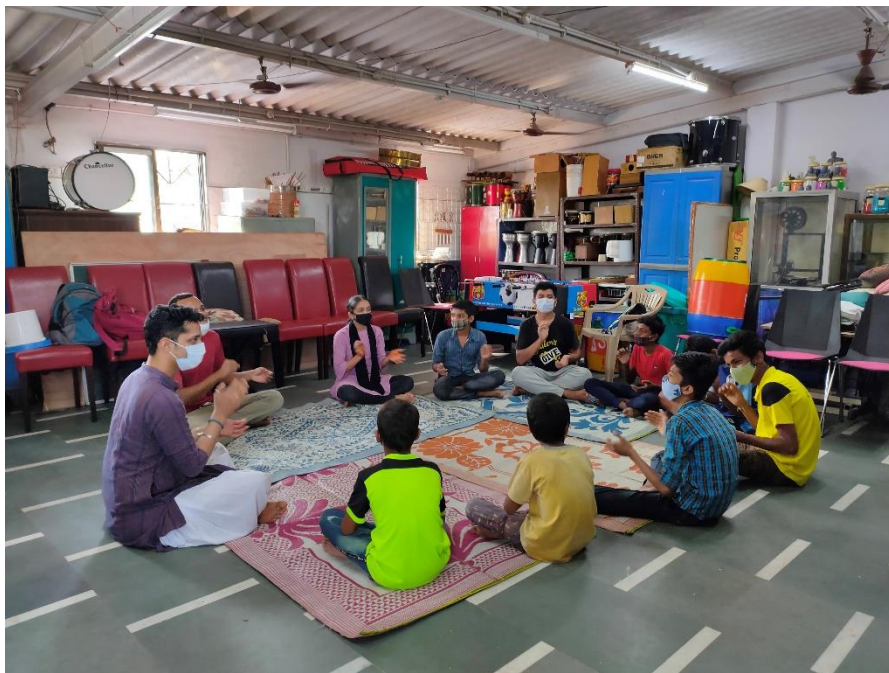
Session on body movement by Artscape