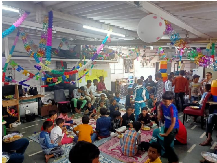
Christmas- new year celebration

Last but not the least, in the spirit of Dharavi, the Acorn community centre continues to celebrate the efforts of its leaders, volunteers and children. The centre hosted a Christmas party get-together for the children.