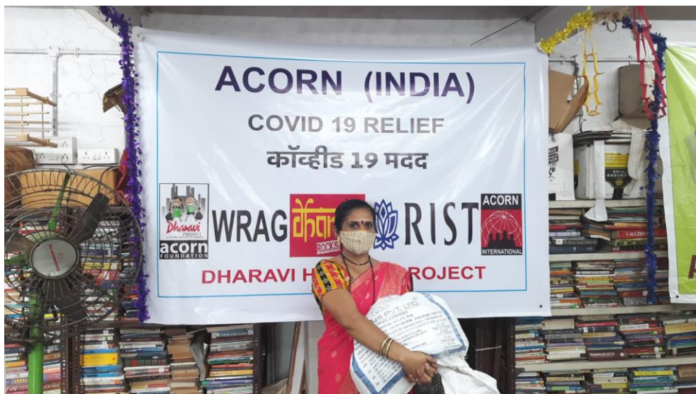
Acorn member collecting ration from centre at Dharavi