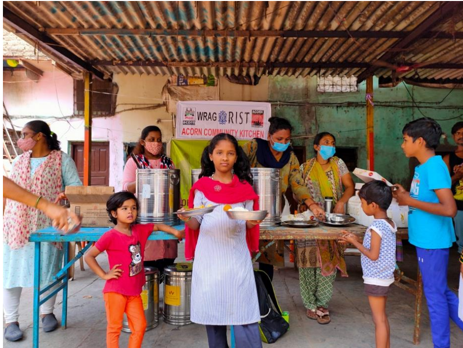
Acorn Community Kitchen at Mahim